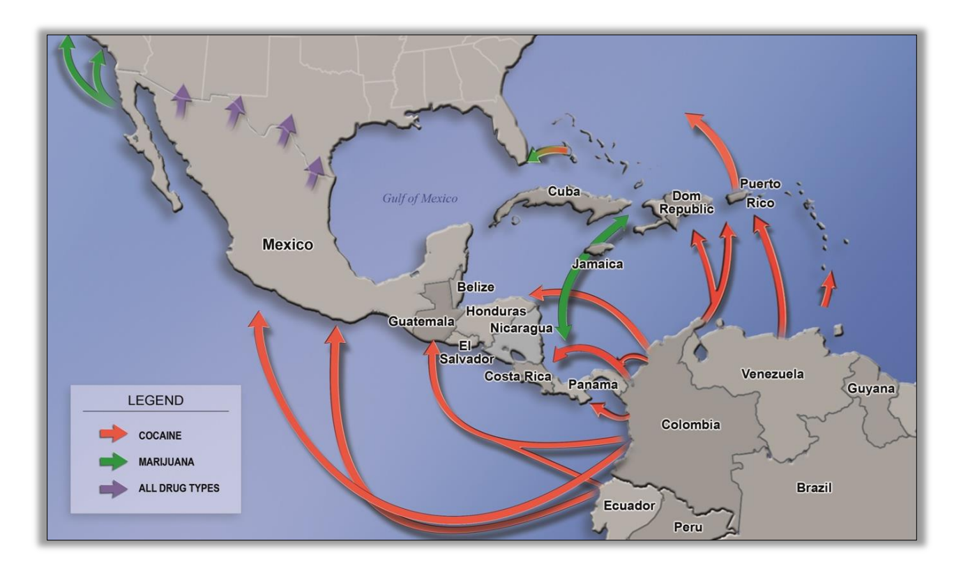
Figure 1. Fiscal Year 2014 Western Hemisphere Drug Smuggling Vectors

Once the drugs land in Central American nations, they are broken down into multiple smaller packages for transshipment to the United States. Although Mexican drug cartels have recently been using panga boats (small, open-air, outboard-powered fishing boats) to move drugs into the United States, the vast majority of the drugs enter through the United States-Mexico land border. Interdicting these smaller packages at the Mexican border is extremely difficult. Consequently, the NDCS focuses on interdicting bulk shipments of drugs in the Transit Zone.