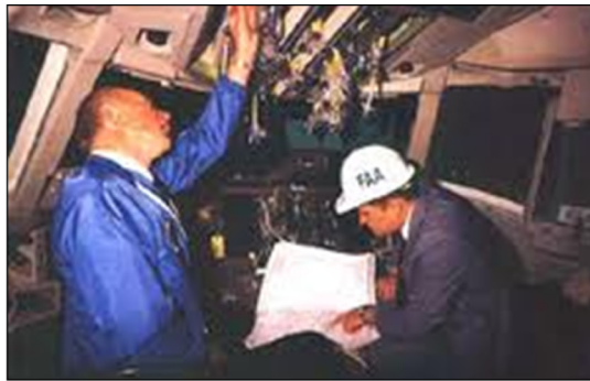
Figure 2: FAA Conducts Inspections as Part of Certification

processes.<sup>18</sup> Subsequently, the 2012 Act required FAA to work with industry to assess the certification process, including reviewing our previous work and developing recommendations to address the concerns that we and others have raised.<sup>19</sup>